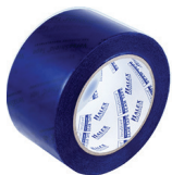
KOVARA® /VS™ MBX seam tape