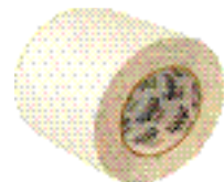
KOVARA® /VS™ double-sided tape (heavy rolling loads)