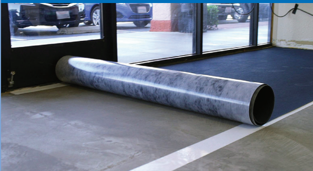
KOVARA® /VS™ MBX moisture barriers