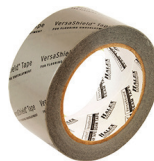
KOVARA® /VS™ 95 seam tape